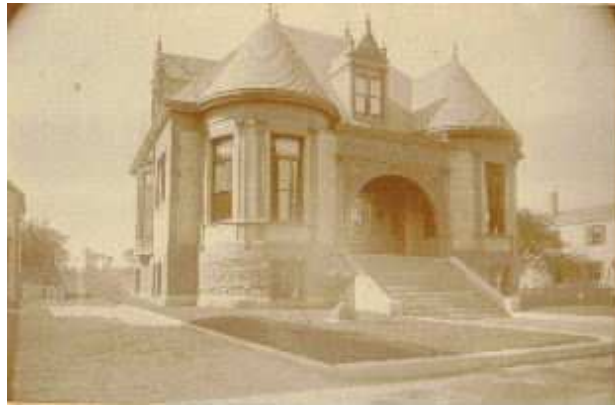
Walker Memorial Library, circa 1900