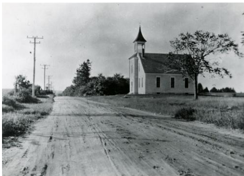
Highland Lake church and the county road